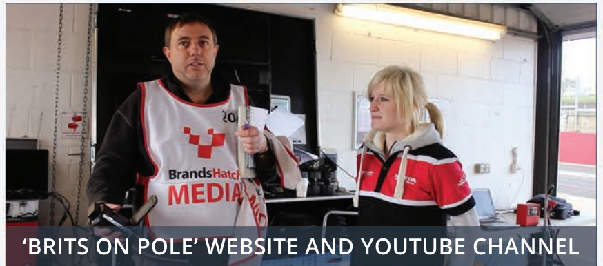
'BRITS ON POLE' WEBSITE AND YOUTUBE CHANNEL