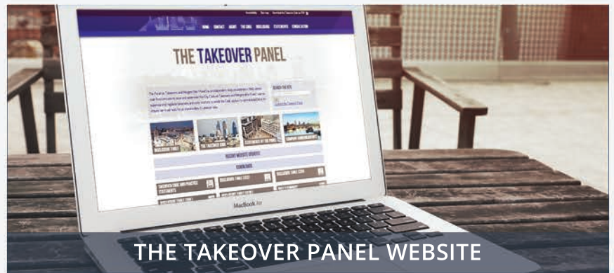
THE TAKEOVER PANEL WEBSITE