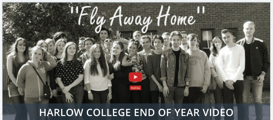
HARLOW COLLEGE END OF YEAR VIDEO